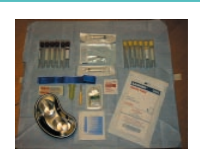
Create a clean field for the working area.